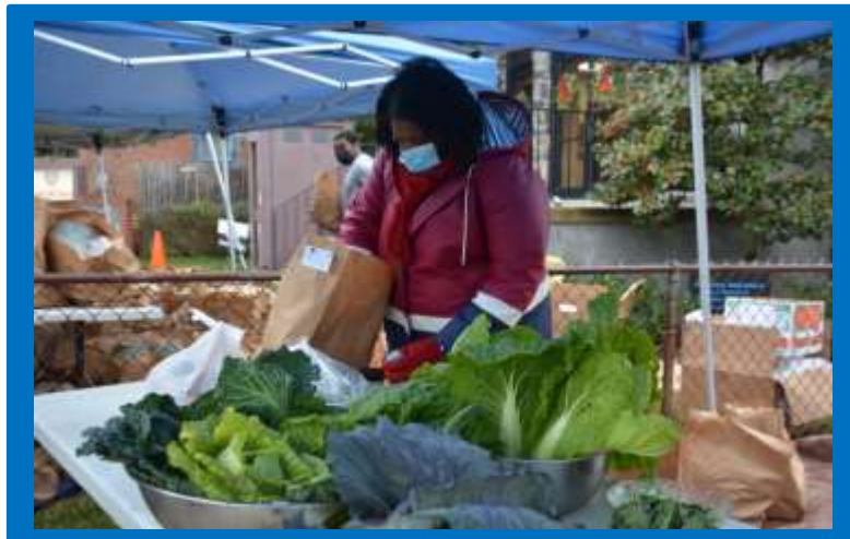
Community Vegetable give away at Bethel Ardmore's Victory