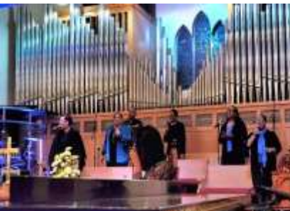
Lay Night Praise Team